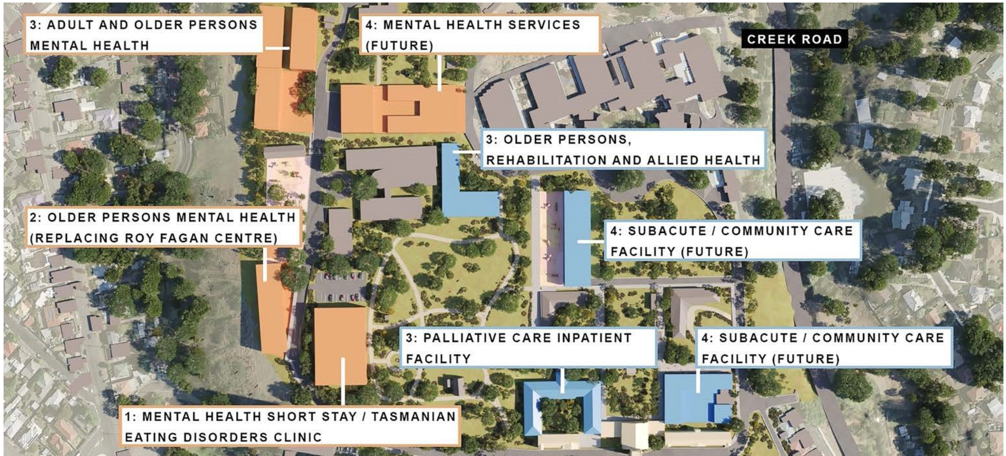
Image: Proposed staged development of the site