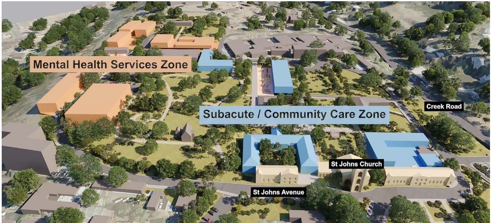
Image: New Mental Health and Subacute / Community Care Zones