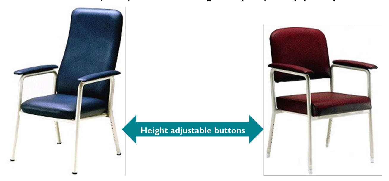
Figure 1: A high-backed chair (left) and bridge chair (right) with height adjustable buttons on chair legs.

This fact sheet does not replace specific instructions given to you by the equipment prescriber.