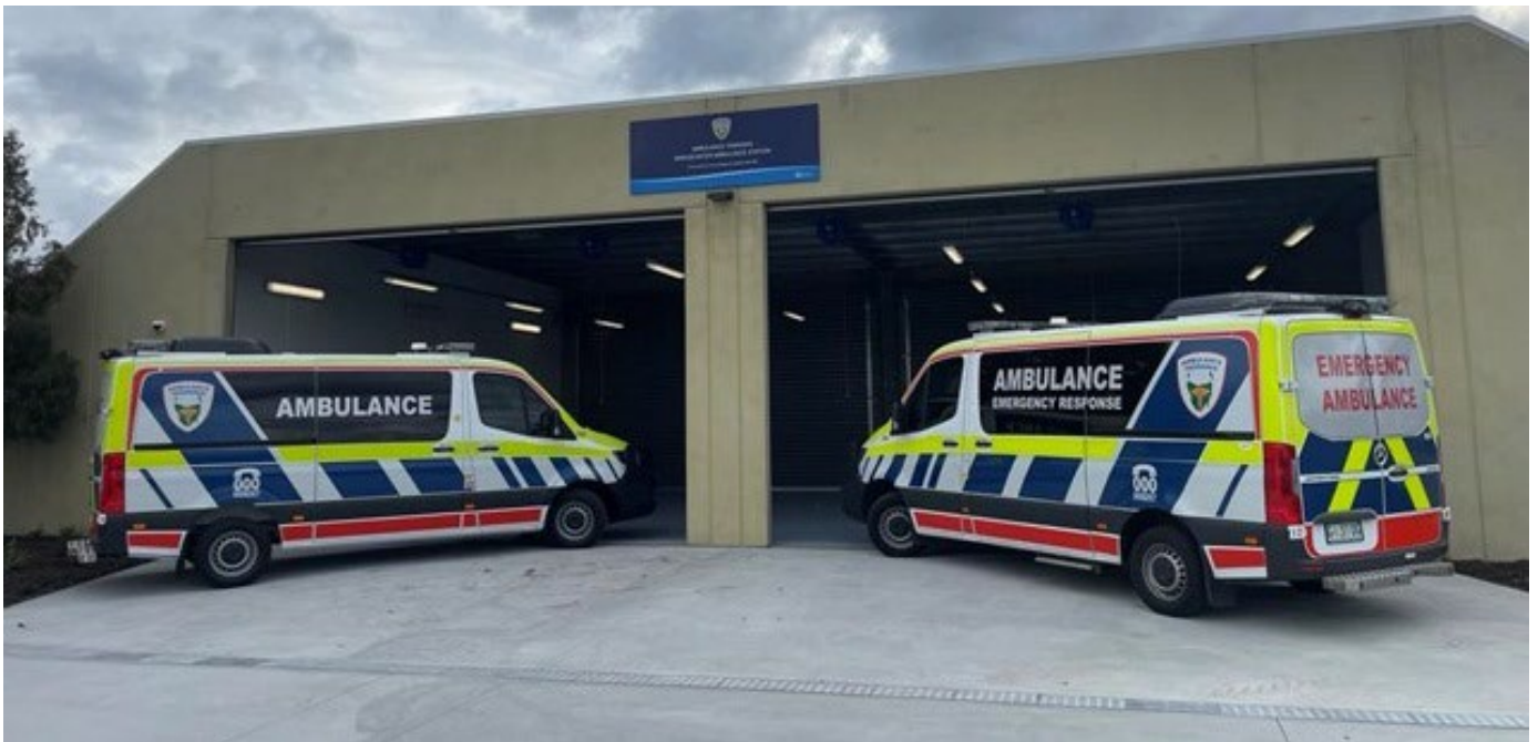
The new Bridgewater Ambulance Tasmania station

Delivery of two state-of-the-art Ambulance Stations at Burnie and Glenorchy also continued. Works to build the Burnie station began in October 2022, and tenders to build the Glenorchy station are currently being considered, with construction due to start in mid-2023.