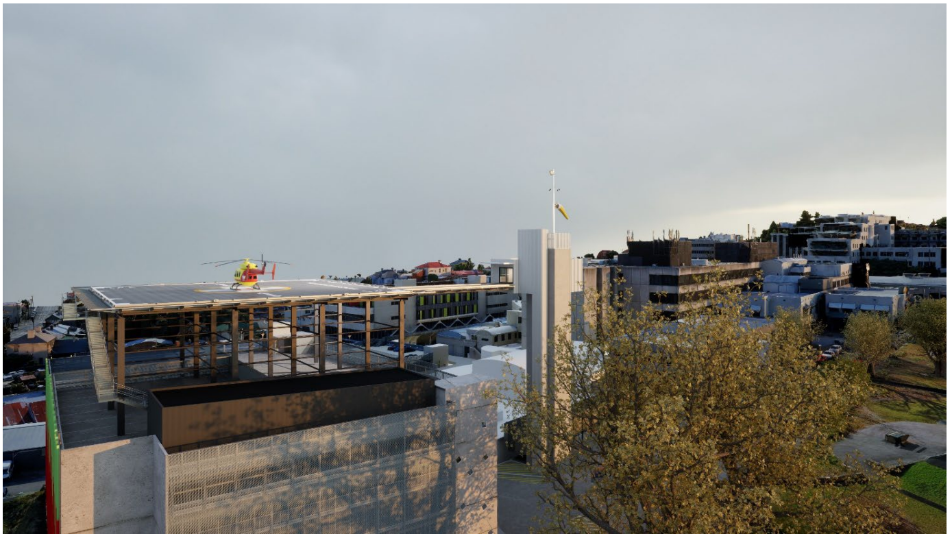
An artist's impression of the new LGH Helipad

The design for a new helicopter landing site at LGH is also being finalised after changes to Civil Aviation Safety Authority (CASA) regulations required the closure of the existing helipad. The new helipad will be on the roof of the Cleveland Street multi-storey car park, allowing a state-of-the-art, contemporary helipad construction with efficient patient transfer to the Emergency Department, ICU and theatres.