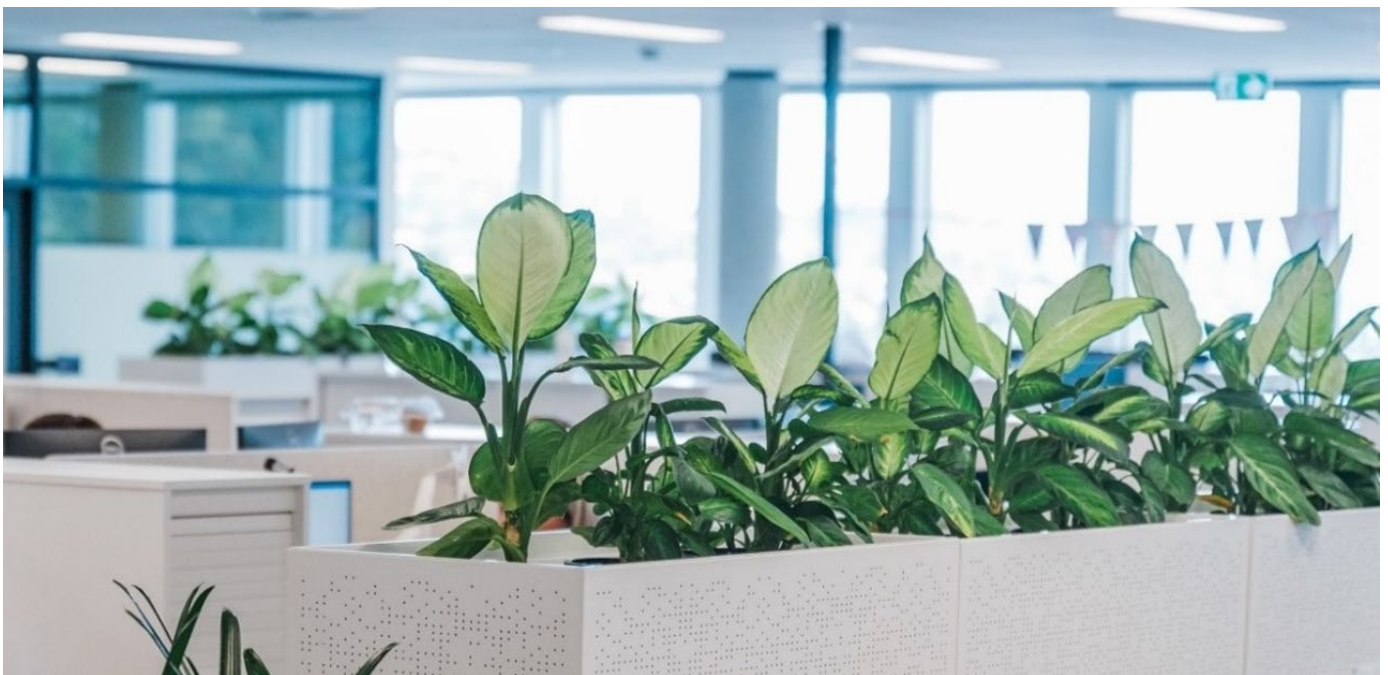
A newly refurbished office at the Department

In late 2022 we began the implementation of the Hobart CBD Accommodation Plan. The Accommodation Plan will see our administrative activities reorganised into a series of 'hub' buildings dedicated to a particular function. It involves a large and complex series of refurbishments and office moves that will be staged over 18 - 24 months. Creating these hubs will improve internal connections by bringing teams together. It will also provide contemporary work environments that meet the Tasmanian Government's Office Accommodation Guideline and enough space for teams to grow over time. As well as hubs within the Hobart CBD, a hub will be created at Cambridge Park to provide a dedicated State Headquarters for Ambulance Tasmania. The first staff moves began in late 2022, and since then, over 800 staff members have been moved as part of the Hobart CBD Accommodation Plan. These moves include refurbishments and relocation of key functions within our offices at 22 Elizabeth Street such as the visitor reception, and teams in HR, Infrastructure Services, and Policy, Purchasing, Performance and Reform.