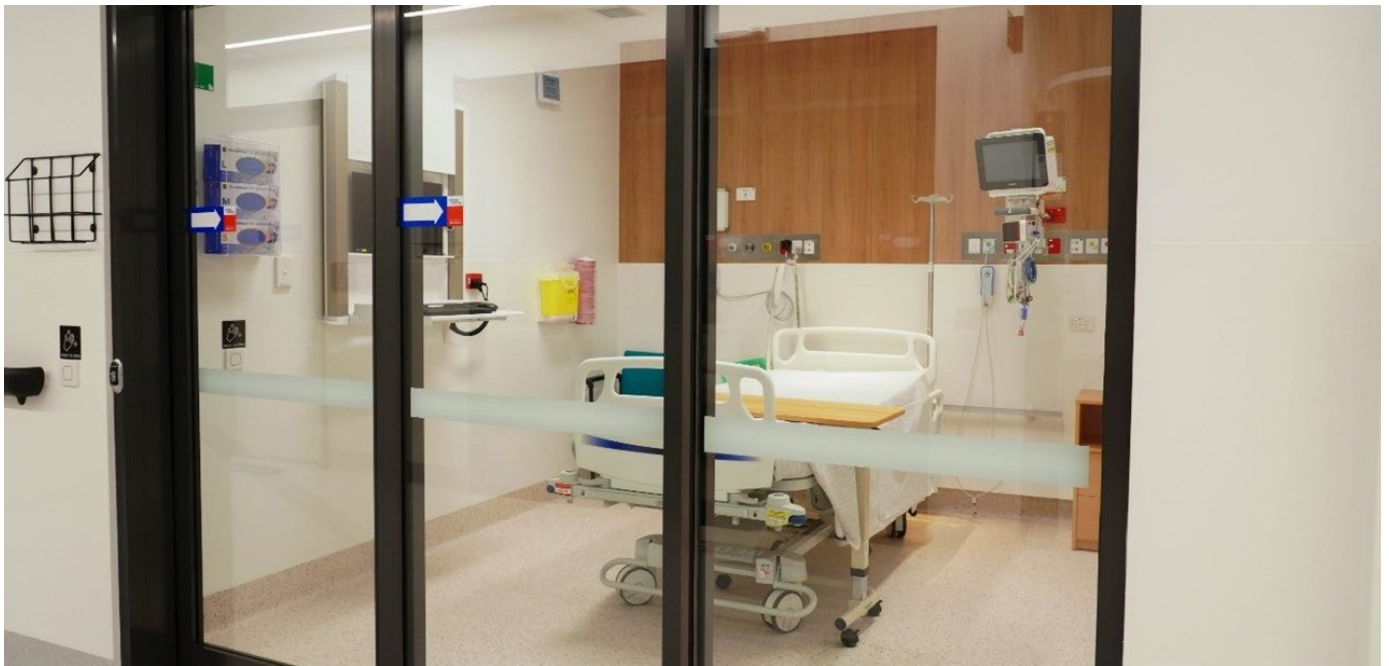
One of the rooms constructed as part of the RHH Emergency Department expansion phase 1

A number of other projects started or progressed during the year at the RHH. The design of the A-Block refurbishment is expected to be completed in early 2024 and the lift replacement has progressed, with tenders to be called in mid-2023. In March 2023, tenders were invited for the Pharmacy redevelopment, and works are due to begin in the second half of 2023. Several small projects are also progressing, including the new Angiography suite and equipment upgrade which is due to start construction in mid-2023. A comprehensive upgrade to D Block Air Conditioning is under construction and scheduled to be finished in early 2024. The design of the Neurology upgrade is completed, and construction will start in late 2023. The bunker for the Linear Accelerator to treat cancer at the Holman Clinic is due to start construction in mid-2023.