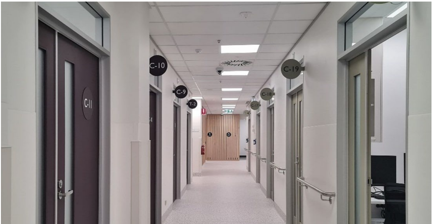
Liverpool Clinics in Hobart

The newly revamped Liverpool Clinics at 59 Liverpool Street (formerly the Vodafone Building) now houses outpatient and pre-admission services to support the Royal Hobart Hospital. The first stage of the Liverpool Clinics opened in May and saw the redevelopment of nearly 1 800 sqm of leased offices into contemporary clinical space. The Liverpool Clinics project supports the implementation of the Tasmanian Government's four-year Elective Surgery and Endoscopy Plan to meet the target of patients receiving surgery within clinically recommended times. Future work will see more clinical services delivered on other building levels as these spaces become available.