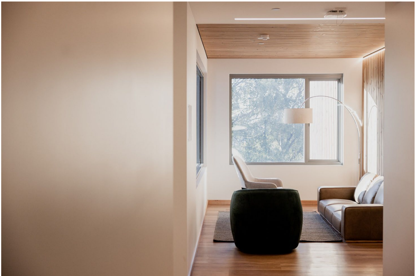
Peacock Centre interior

In the North, the design of the new Northern Tasmanian eating disorder service is underway. Tenders for the project are expected to be invited in early 2024.