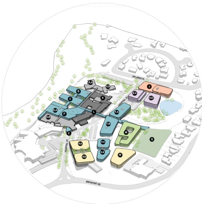
North West Regional Hospital site Masterplan