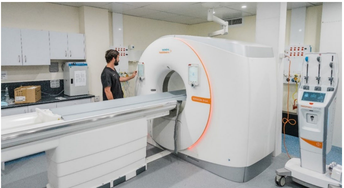
Specialist Medical equipment

The first stage of the project, the maturity assessment, has been finalised, identifying strengths, weaknesses, and risks associated with existing management practices for medical equipment. Findings from the maturity assessment inform our next steps, including developing a rolling ten-year Asset and Risk Management Plan. Adopting MEAMF will allow a strategic asset lifecycle management approach to maintaining medical equipment across the state and enable more effective forward planning.