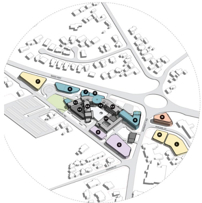
Mersey Community Hospital site Masterplan