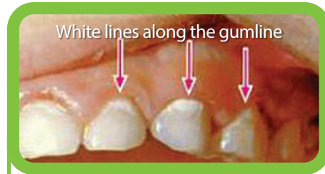
Early Stage Decay

Encourage parent/guardian to make child a dental appointment.