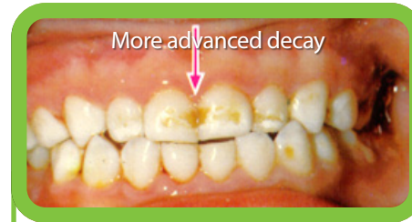
More Advanced Decay

This may be reversible if treated early.